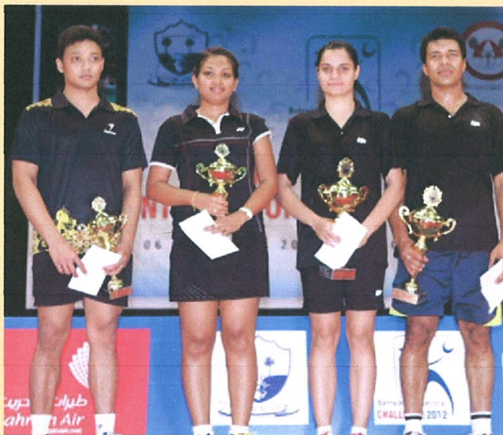
Mixed Doubles Runners up -left &amp; winners - right

The women's final was also a three-game affair with