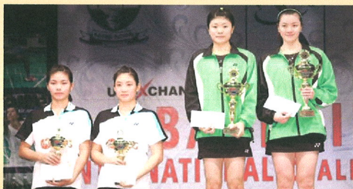
Womens Doubles Runners up (left) and winners (right).