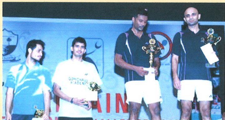
Mens Doubles runners up (left) and winners (right).